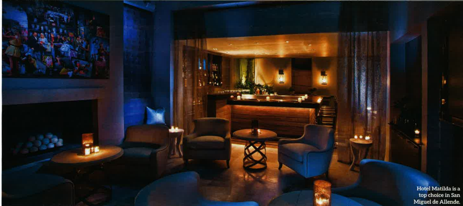
Hotel Matilda is a top choice in San Miguel de Allende.