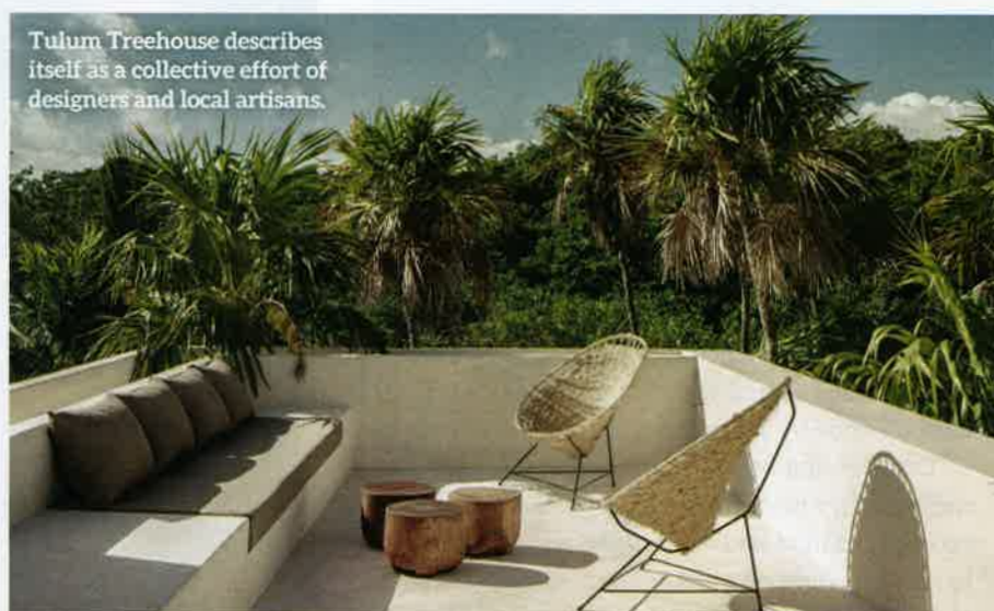
Tulum Treehouse describes itself as a collective effort of designers and local artisans.