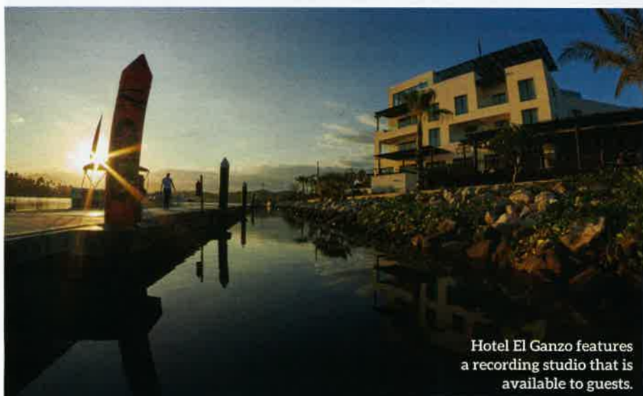
Hotel El Ganzo features a recording studio that is available to guests.